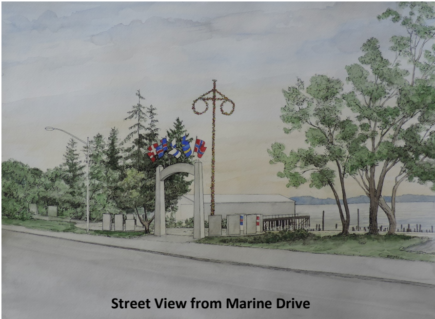
Street View from Marine Drive