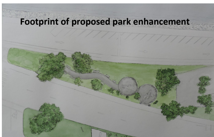
Footprint of proposed park enhancement

The proposed Scandinavian Immigrant Park will fill a need mentioned in the City of Astoria Parks and Rec Master Plan for more urban plaza space. ASHA intends to work with Parks and Rec throughout the planning process to gain their input and approval for the design. The proposed park is NOT a new park but an enhancement to a current park already under Parks and Rec jurisdiction.